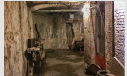
ABOVE: Typical areaway with street wall on the left.

An areaway is a space under a sidewalk, between the street and a building that fronts on it. In Pioneer Square, the areaway foundation walls have deteriorated over time and need repair.